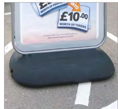
Lower cost, lighter weight base option available for 30" x 40" and A0 sizes. Volume/contract enquiries only. Call for details.