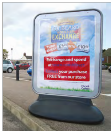
Sentinel® working hard for major retailers across the country