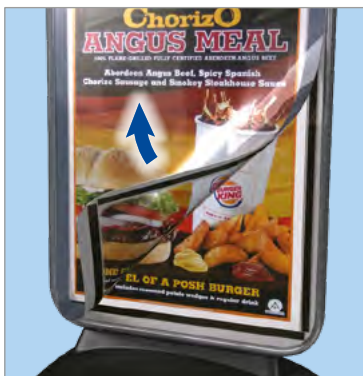
Magnetic poster covers for quick and easy poster change

Black base as standard to hide dirt and marks