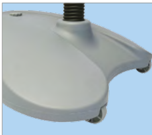
Built-in wheels for ease of movement