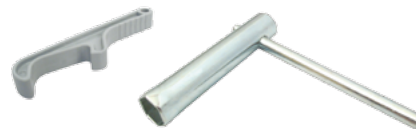
Snapframe opening tool (left) and 2-piece spanner (right) included with each unit